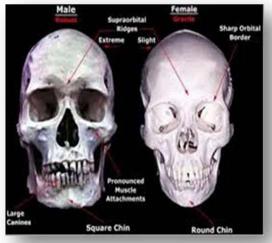
Figure No. 4: Gender identification using skull

Determining the person's biological gender is frequently one of the most important questions pertaining to skeletal remains in the complex field of forensic anthropology. By carefully analyzing skeletal traits and indicators, forensic anthropologists use a multimodal method to decipher gender secrets encoded in bone. Together, we will delve into the intriguing field of gender determination and examine the techniques used by forensic anthropologists to unravel this essential facet of the human experience.